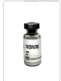
Tirzepatide 60mg - 032026

Date Tested: 04/01/2026 | Method: Full Peptide QC Panel