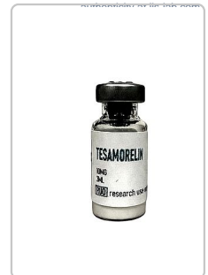
Tesamorelin 10mg - 032026

Date Tested: 04/01/2026 | Method: Full Peptide QC Panel