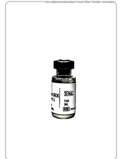
Semax 11mg - 032026

Date Tested: 04/01/2026 | Method: Full Peptide QC Panel