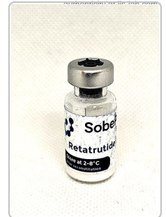
Retatrutide 60mg - 032026

Date Tested: 04/01/2026 | Method: Full Peptide QC Panel