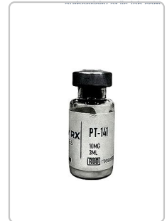
PT-141 10mg - 032026

Date Tested: 04/01/2026 | Method: Full Peptide QC Panel