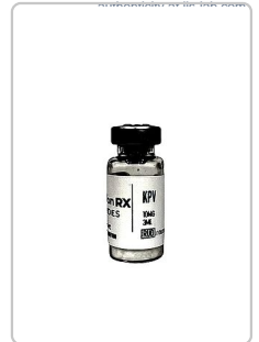
KPV 10mg - 032026

Date Tested: 04/01/2026 | Method: Full Peptide QC Panel