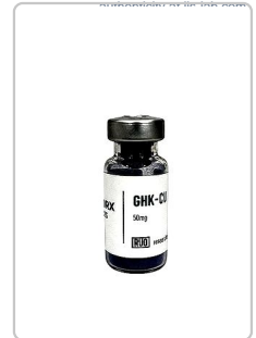
GHK-CU 50mg - 032026

Date Tested: 04/01/2026 | Method: Full Peptide QC Panel