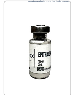
Epithalon 10mg - 032026

Date Tested: 04/01/2026 | Method: Full Peptide QC Panel