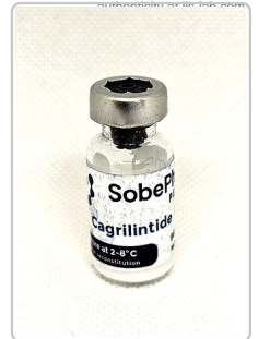
Cagrilintide 5mg - 032026

Date Tested: 04/01/2026 | Method: Full Peptide QC Panel